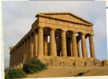
Valley of the Temples