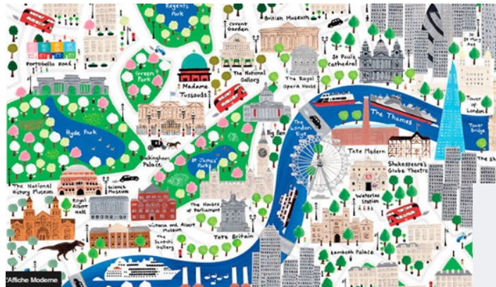
A map of central London landmarks