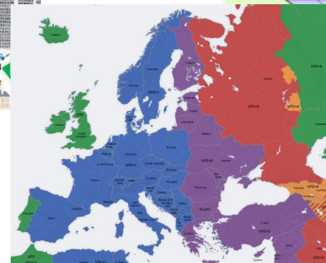
This map of Europe shows different time zones in different colours. Time in countries to the west of the Prime Meridian is always behind that of the UK.